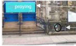
Banner over old front door